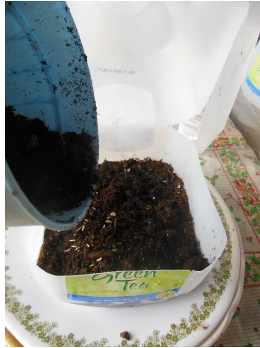
Cover seeds with a light covering of soil.