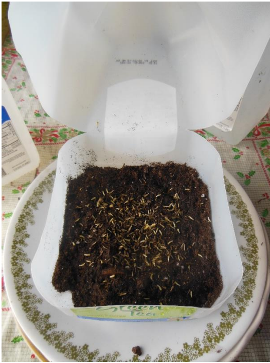
Sprinkle seeds on top of the wet soil.