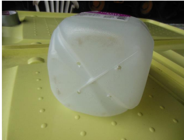
Drill holes in the bottom for drainage