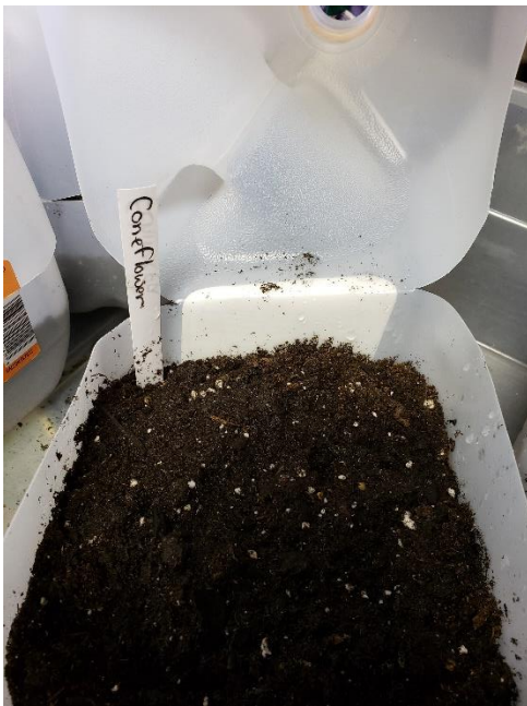
Insert a PLANT LABEL so you will know what grows.