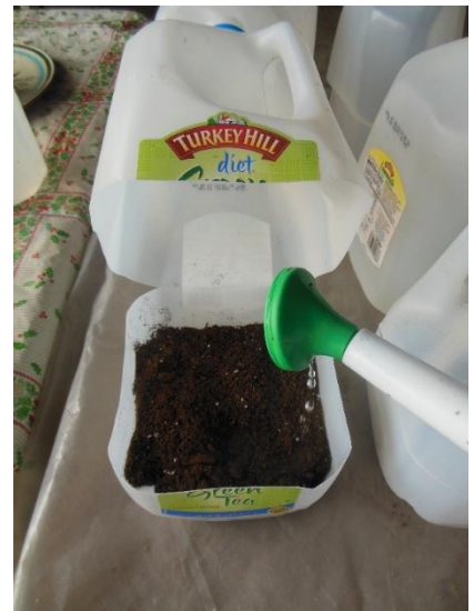
Water Soil Well.