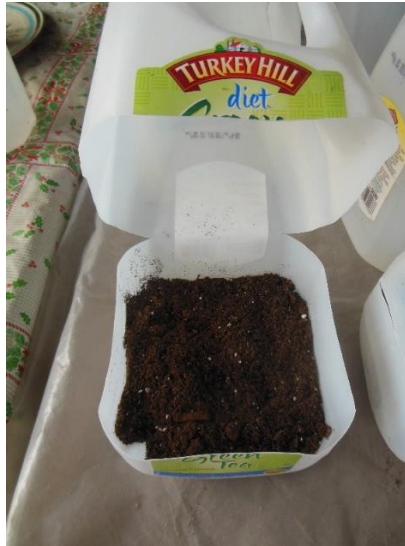
Add soil half way up.