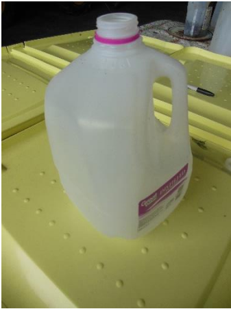
Opaque plastic jugs

Many perennial seeds need to be stratified by the cold weather of winter. The cold weather stimulates germination of the seeds for many perennial plants. You can spread seeds directly in the ground in the Fall or you can plant them in milkjugs that you will heel into your garden for the cold winter. NOTE: When I took these pictures, I was planting Echinacea seeds- coneflowers. I did not find that they germinated well for me. I generally plant various milkweed seeds and try all sorts of seeds to see what will germinate. Have fun trying your favorite seeds.