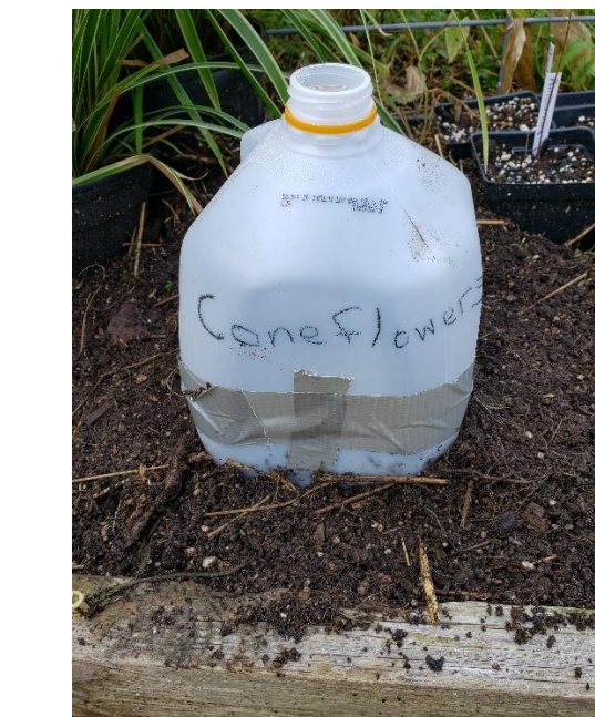
Use Duct Tape for close the jug around the middle.

No cap on jug. Take the jug to your garden and pull back the soil so you can snug your jug down in the soil for the winter. The cold winter will stratify the seeds to germinate/emerge in the spring. Then carefully take apart the tiny plants and transplant them into pots to continue growing before planting them in the ground.